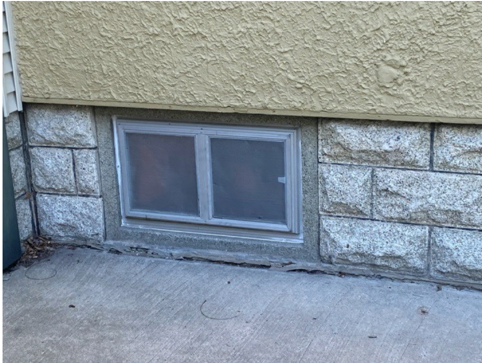
7 Foundation Type