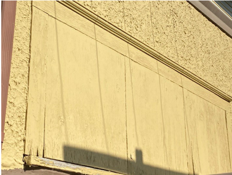
27 Exterior Wall Hazard