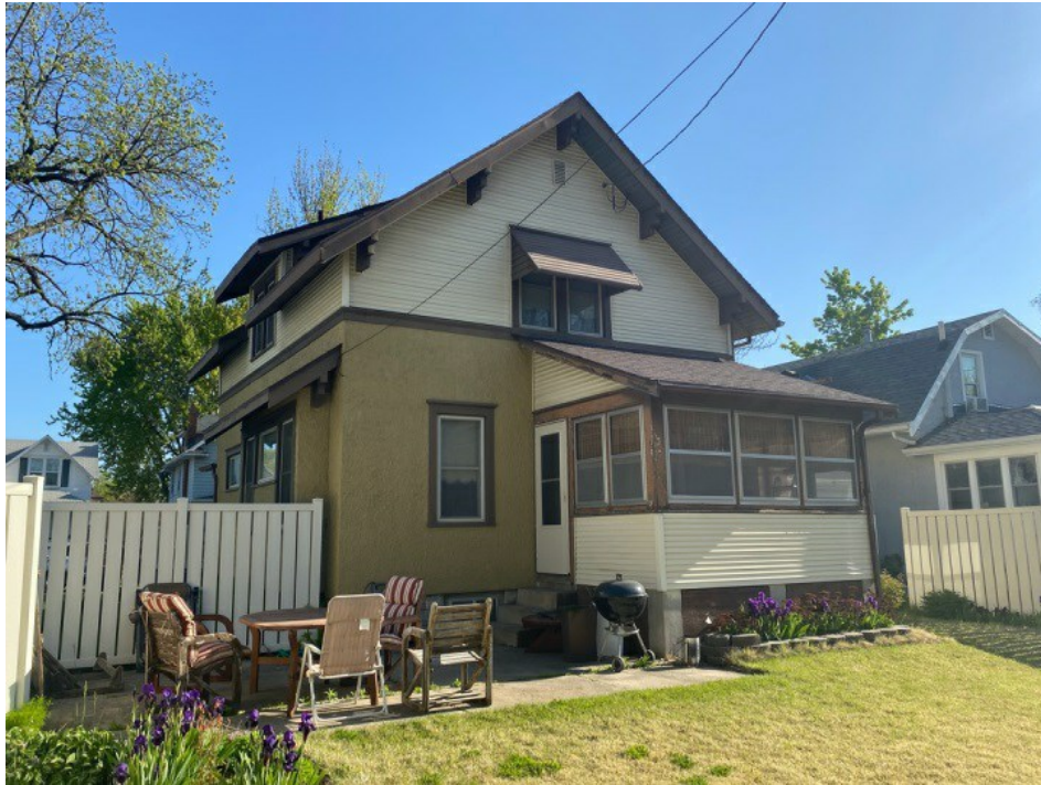
19 Right Rear of Dwelling