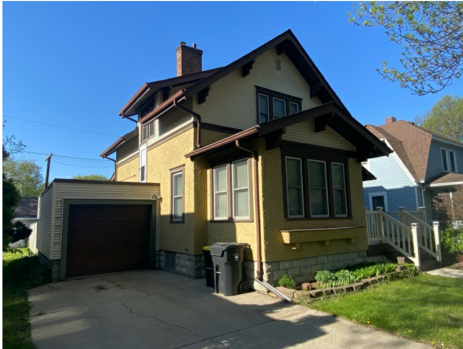
5 Left Front of Dwelling