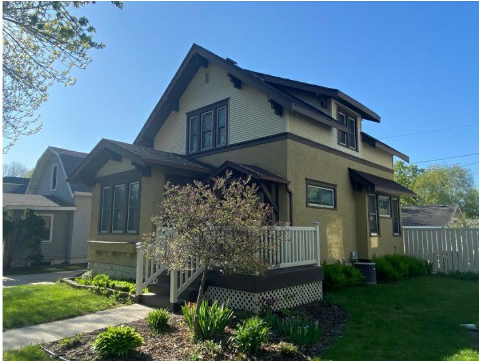
11 Right Front of Dwelling