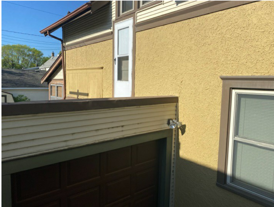
9 Porches, Patios, Decks & Stairs Hazard