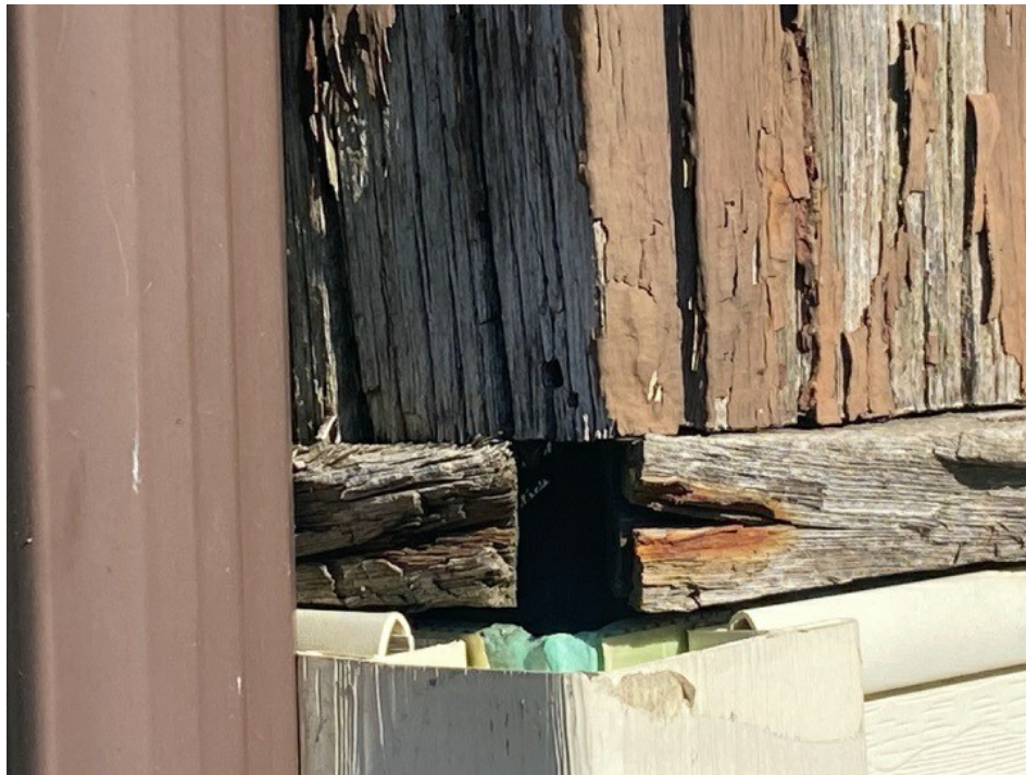
29 Exterior Wall Hazard