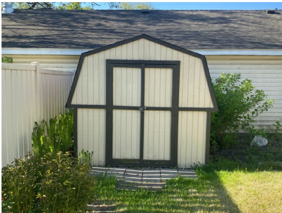
18 Detached Structure