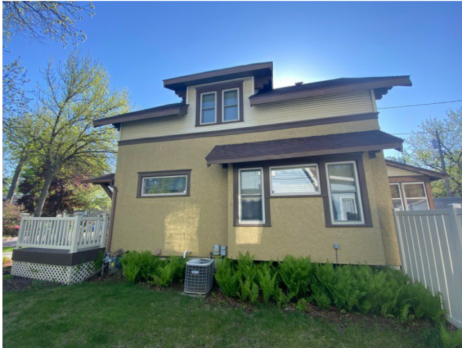
17 Right Side of Dwelling