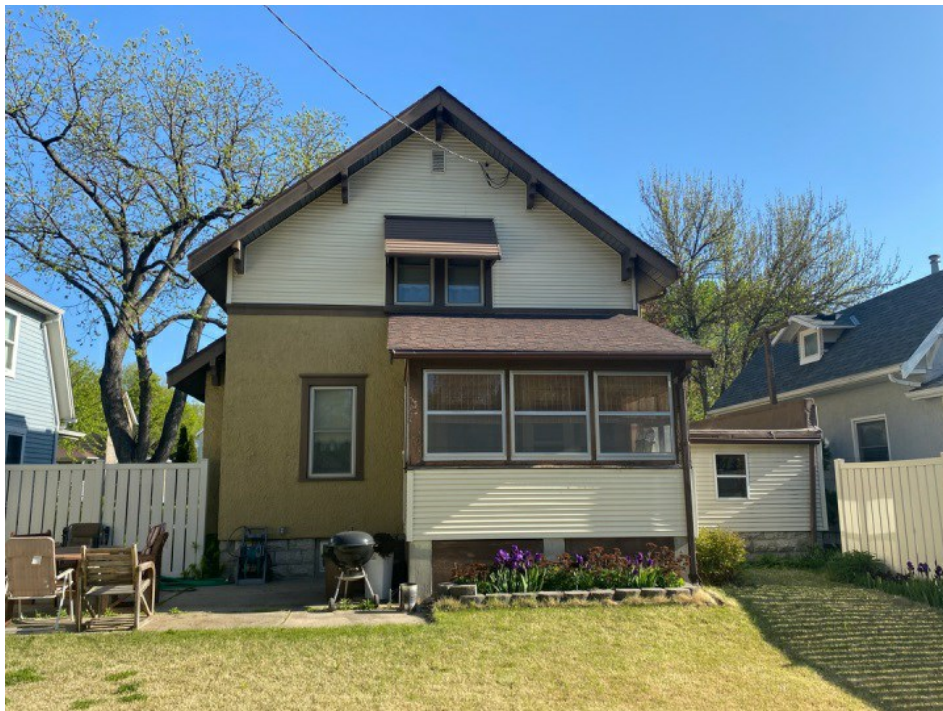
20 Rear of Dwelling