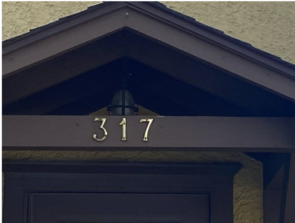
1 Address Verification