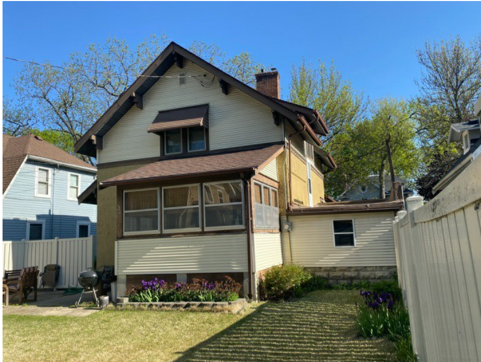
21 Left Rear of Dwelling