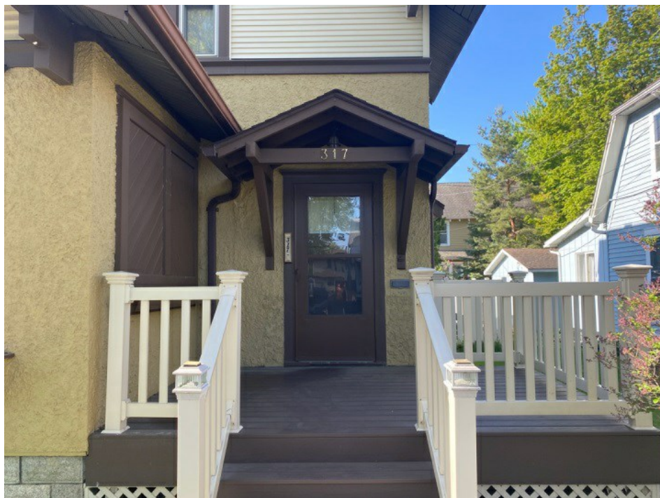
2 GPS Location