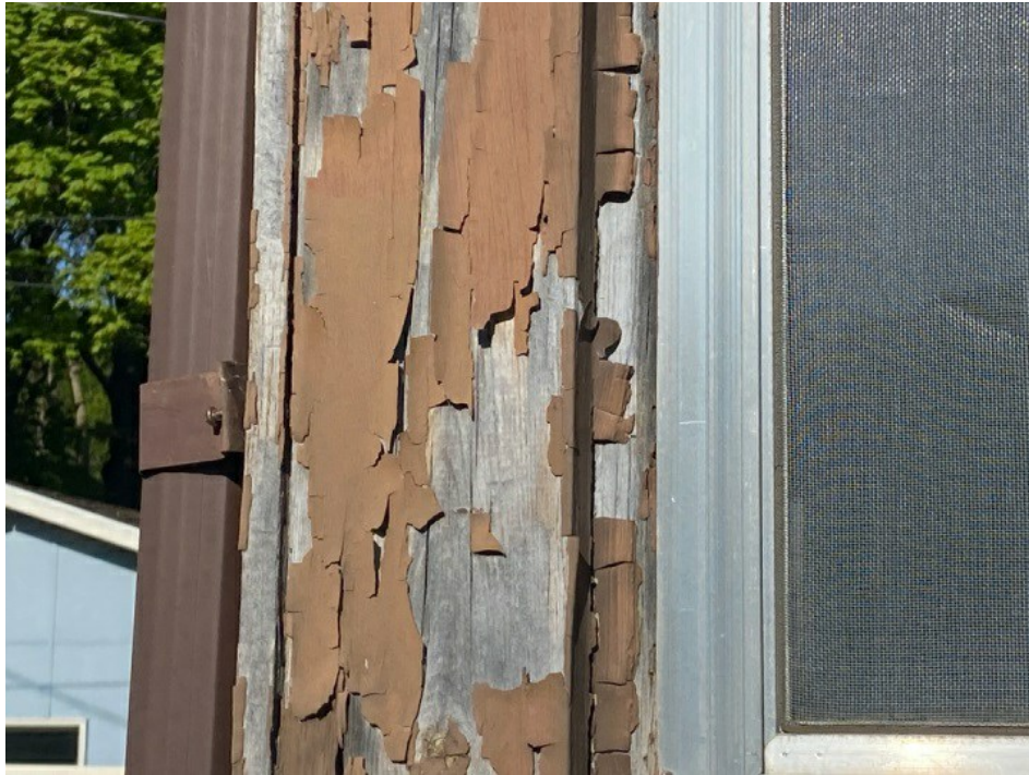
25 Exterior Wall Hazard