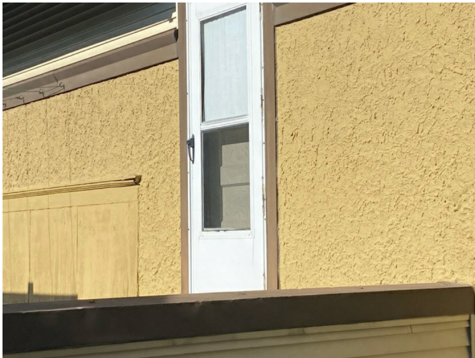
10 Porches, Patios, Decks & Stairs Hazard