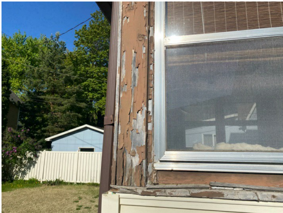
24 Exterior Wall Hazard