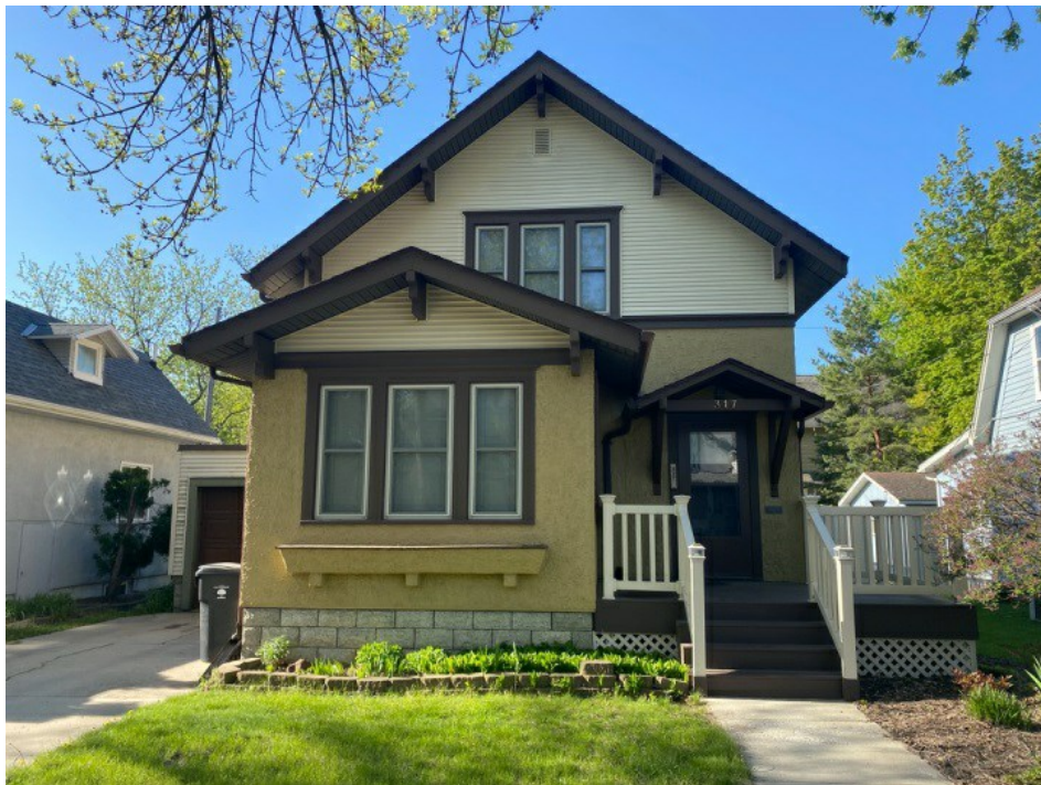
4 Front of Dwelling