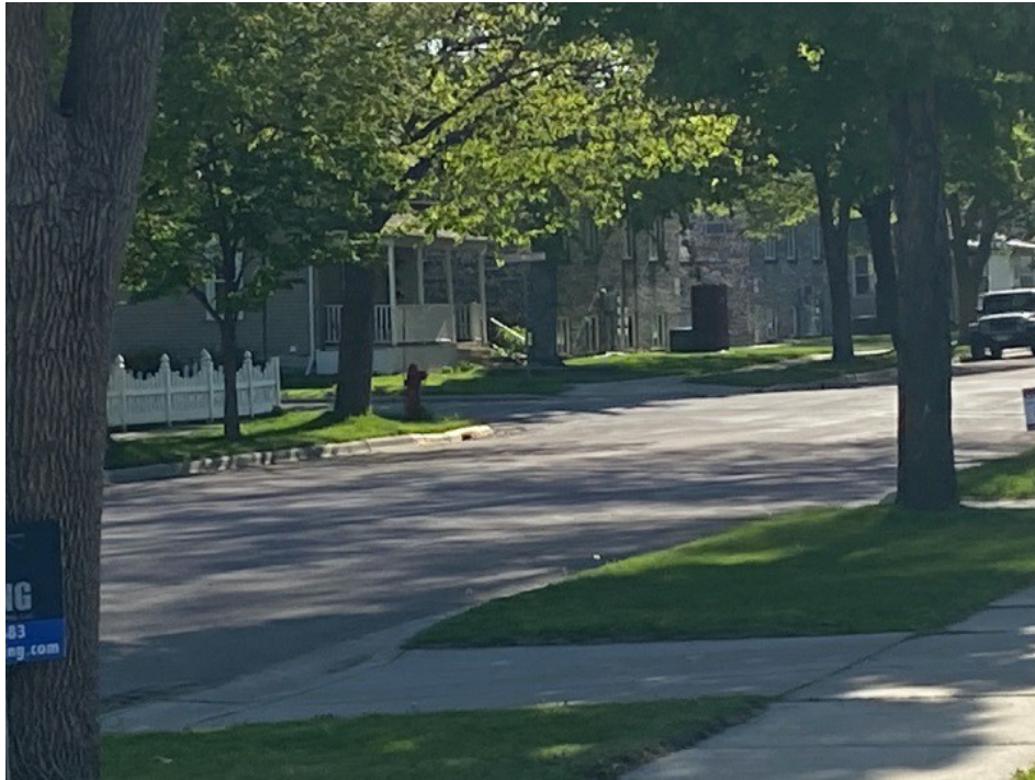
3 Fire hydrant