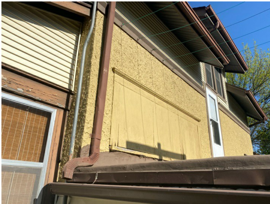
26 Exterior Wall Hazard