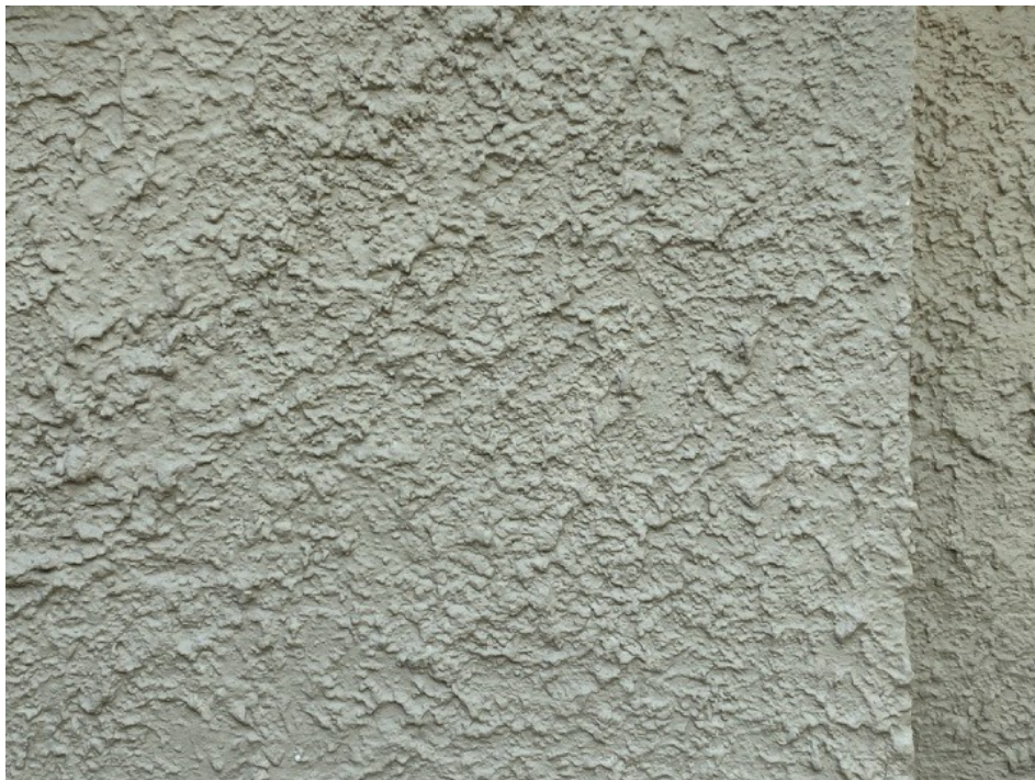
8 Exterior Wall Closeup