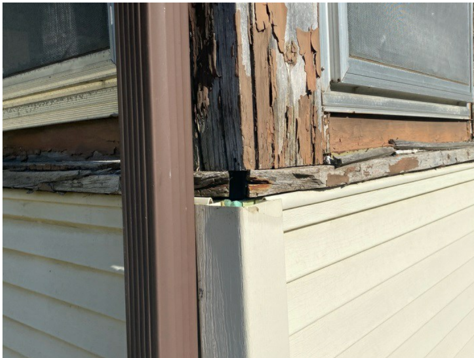
28 Exterior Wall Hazard