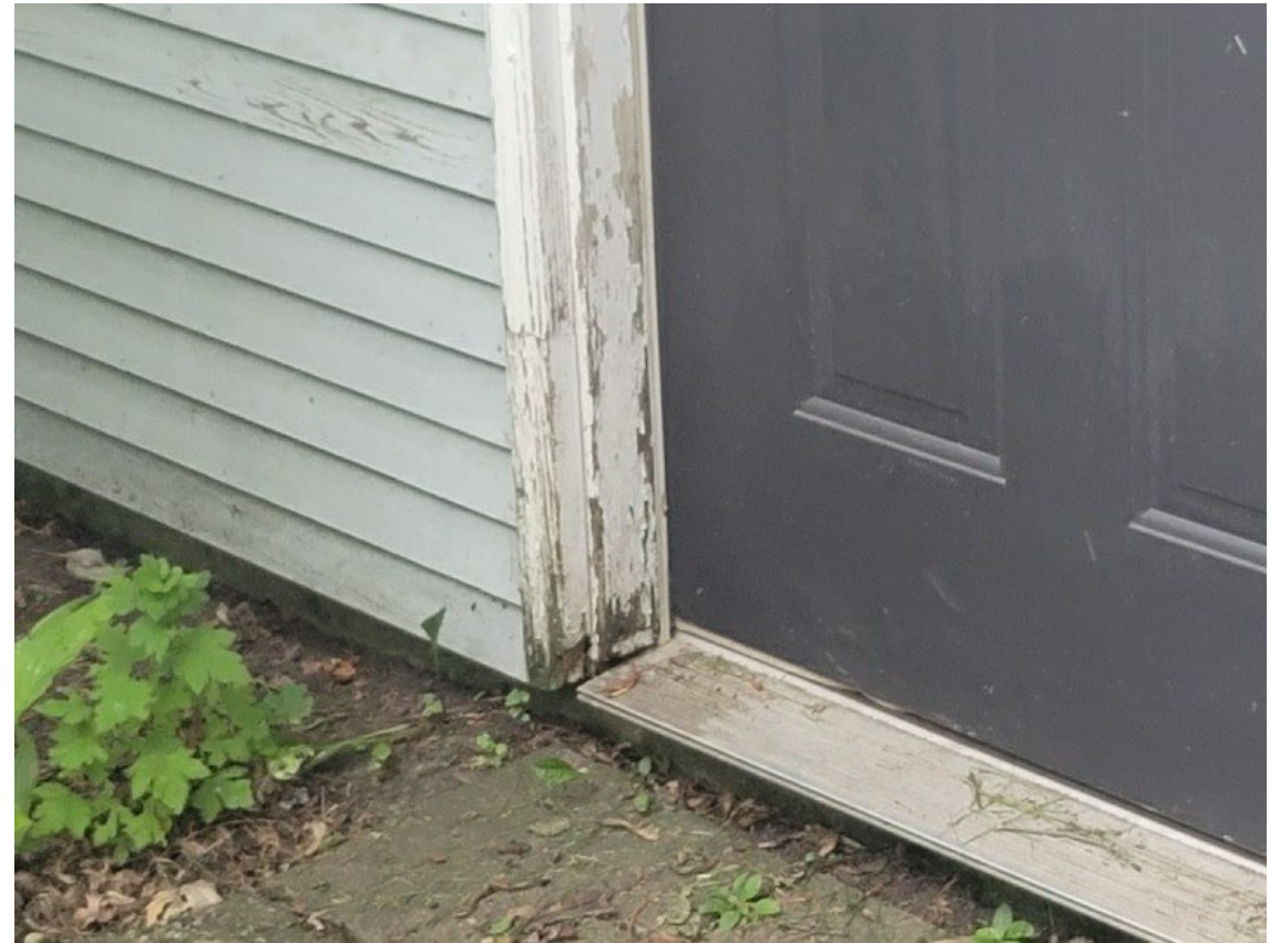
14Detached Structure Hazard