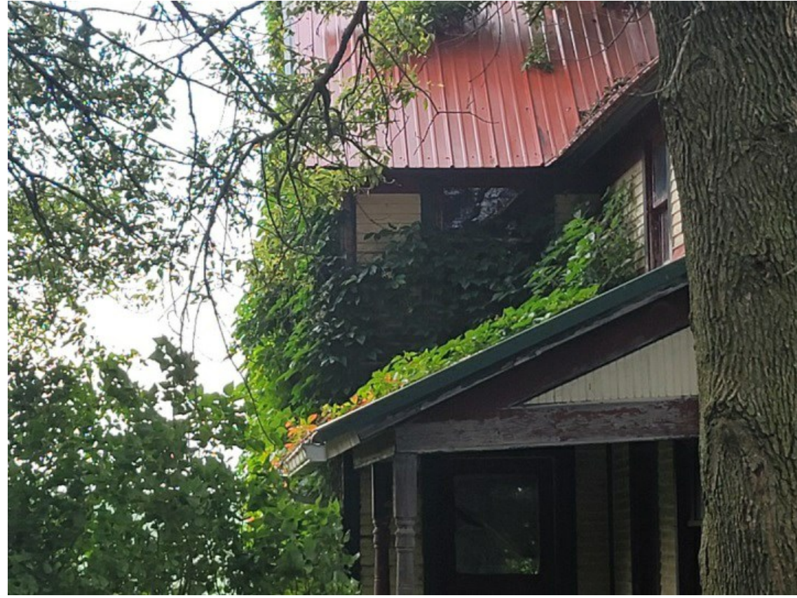
33Detached Structure Hazard