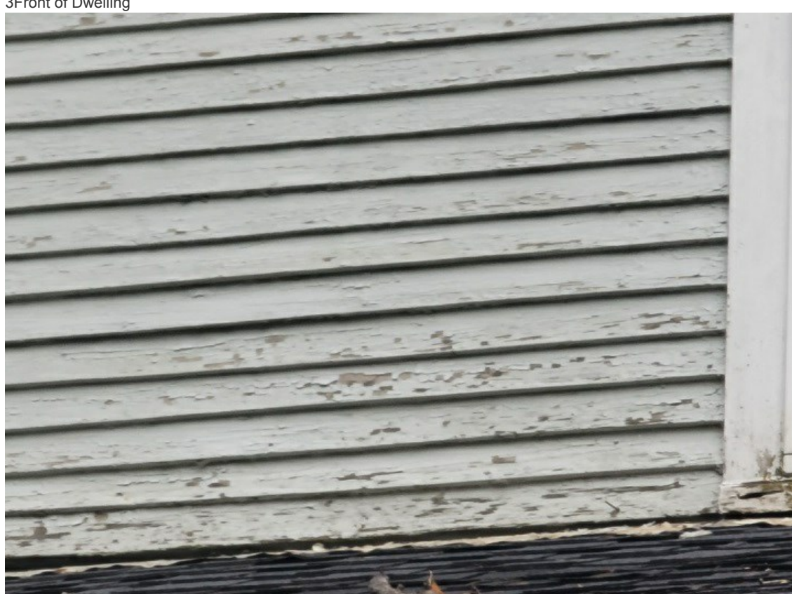
4Exterior Wall Hazard