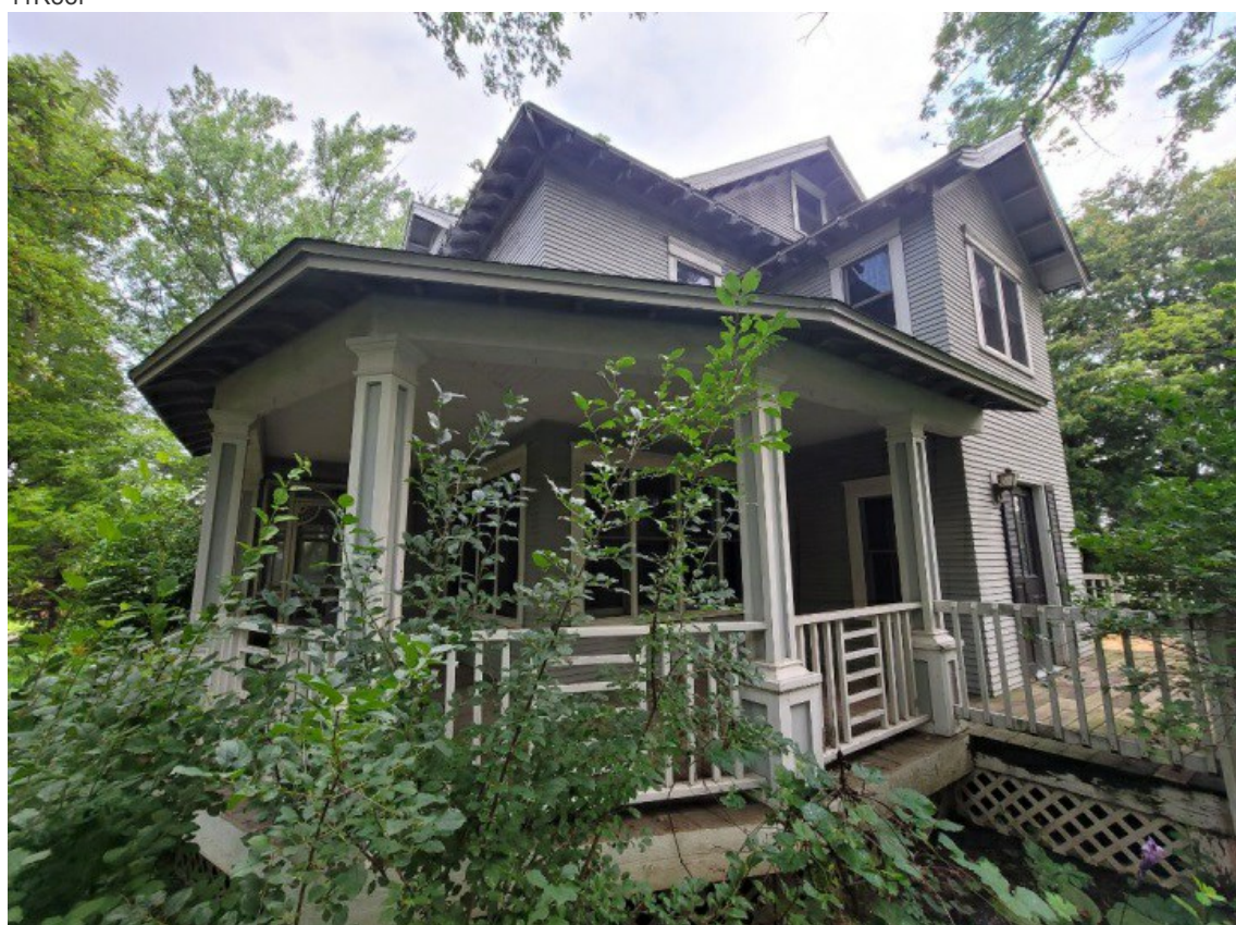
12Right Front of Dwelling