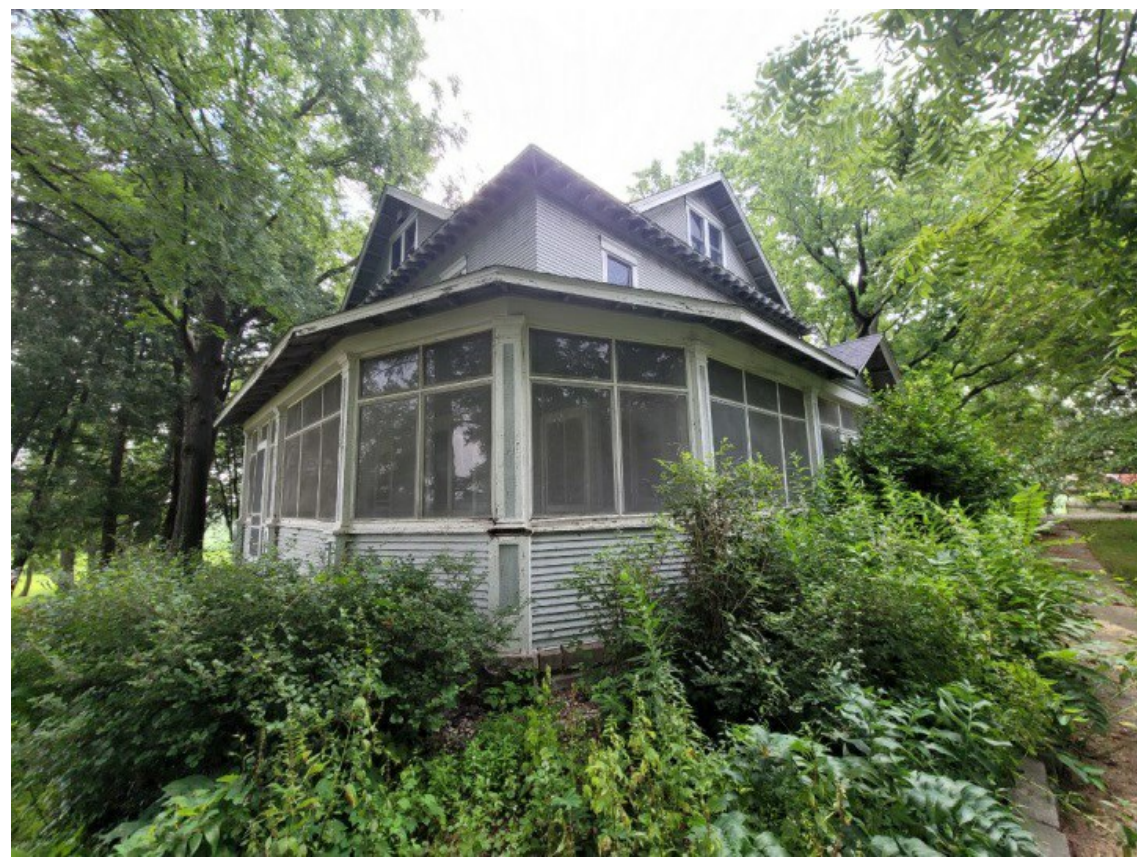
7Left Front of Dwelling