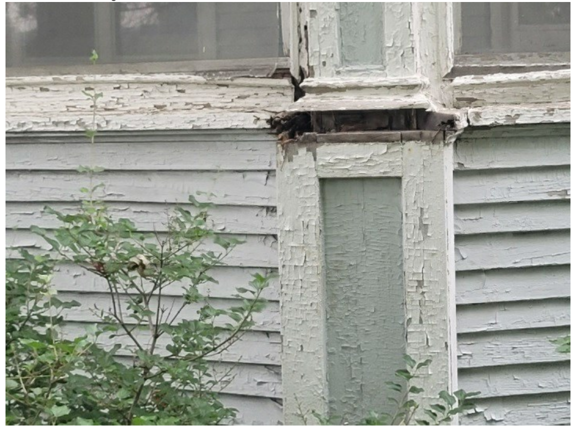
8Exterior Wall Hazard