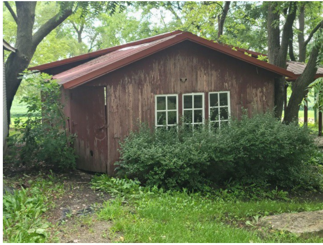
27Detached Structure Hazard