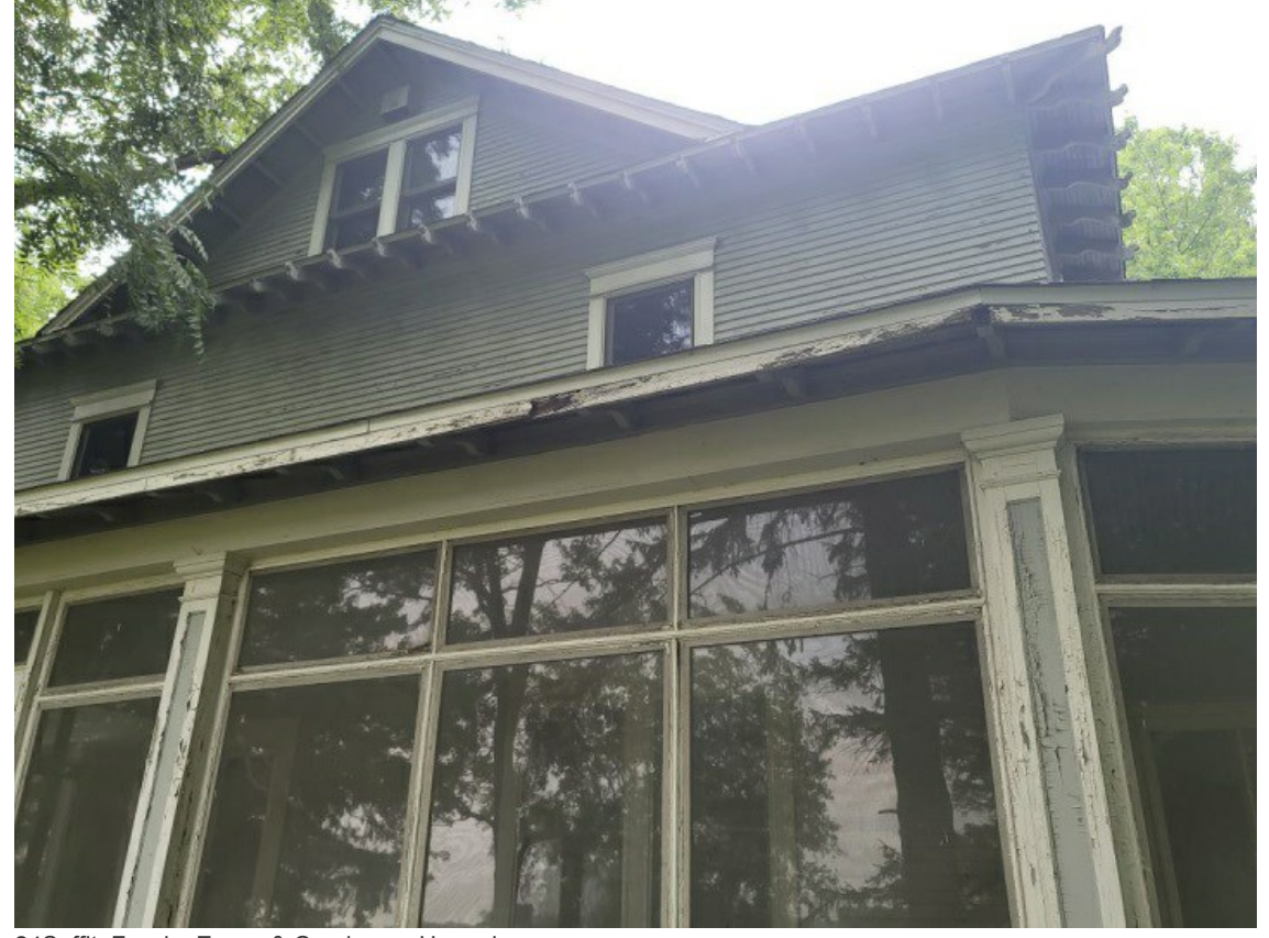
24Soffit, Fascia, Eaves & Overhangs Hazard