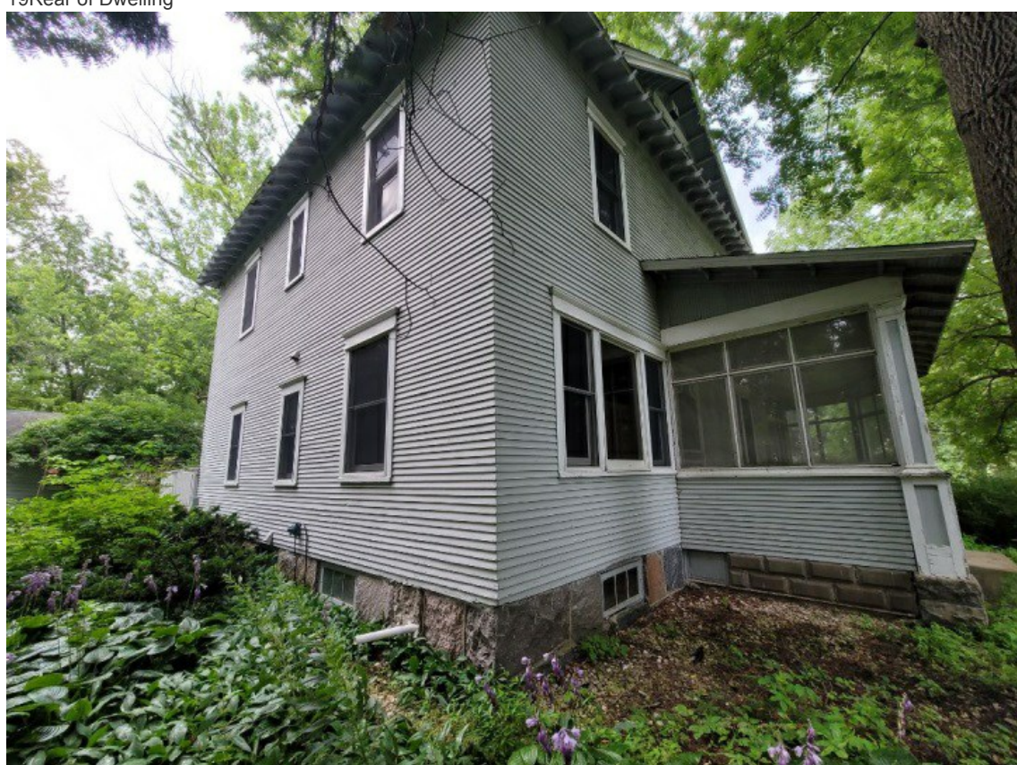
20Left Rear of Dwelling