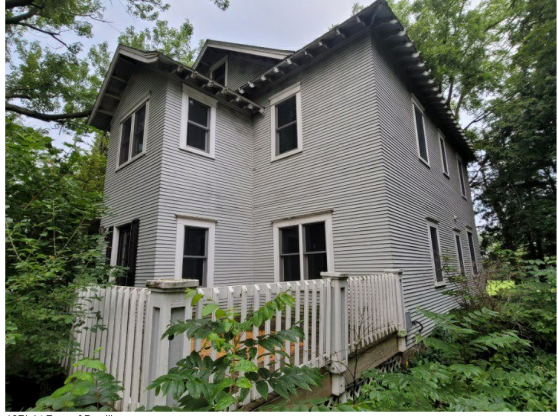
16Right Rear of Dwelling