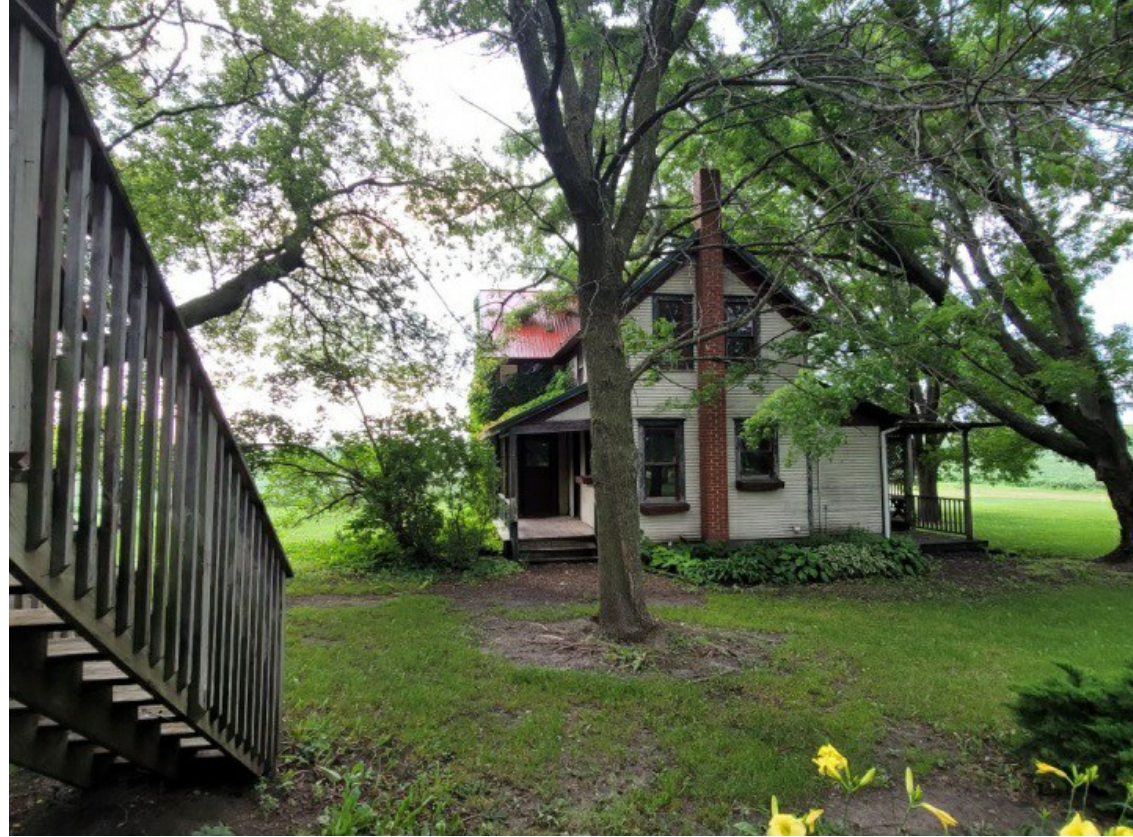
34Detached Structure Hazard