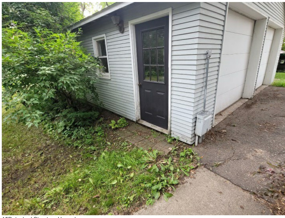
15Detached Structure Hazard